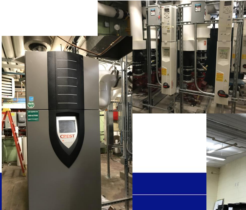
Berthoud ES – boiler/pumps