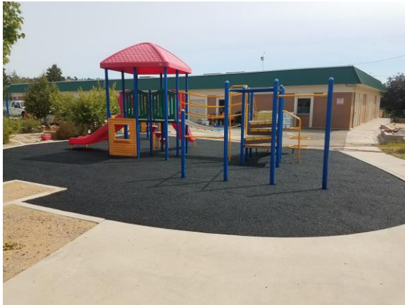
Big T ES